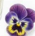
KAFFIR LIME COOLER