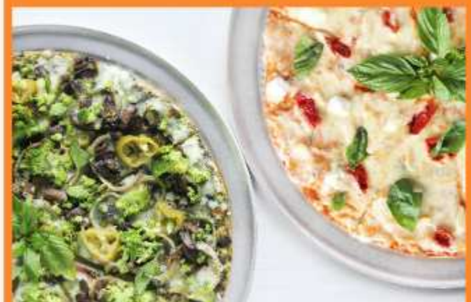
MEXICANA & AL CAPRINO