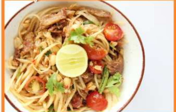
THAI SOM TAM & MOCK DUCK