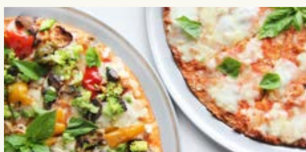
Grilled Veggie (L), Margherita (R)