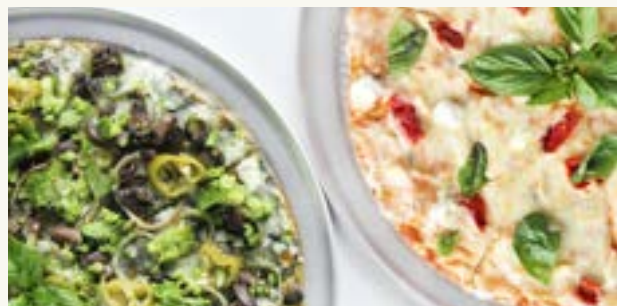
Mexicana (L), Al Caprino (R)

Open 24 Hours Tuesday to Sunday & Monday open 6pm onwards